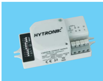
HC009S /R (page14)