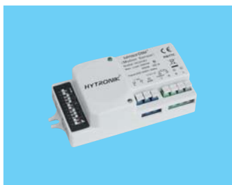
HC018V /R (page20)