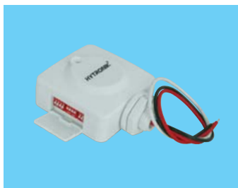
HC030S /R (page111)